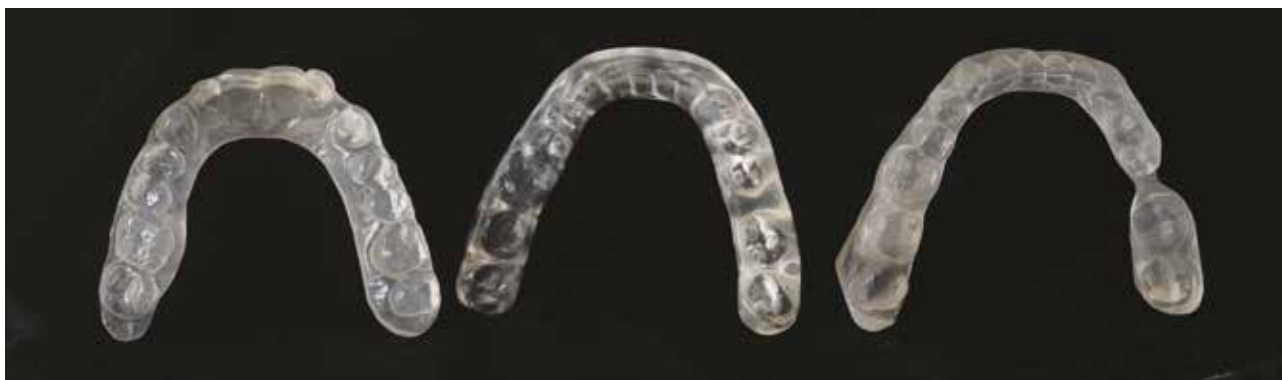
FIG. 5 Splint produced with a multi-jet 3D printer and verified on the prototyped casts.