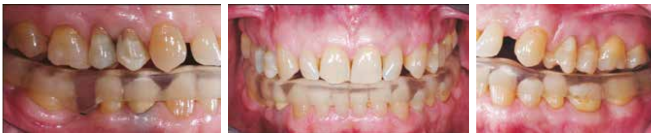
FIG. 6 Intraoral pictures of the splint immediately after delivery.

The authors presented a technique to manufacture