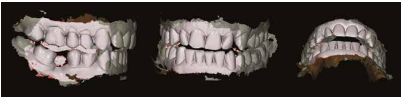
FIG. 2 Intraoral scan with dental arches at the correct vertical relationship as obtained with Dawson's manipulation.

The intraoral scans of the maxillary and the mandibular arches presented enough points in common with the bite registration to have the maxillary and mandibular arches "digitally mounted" with the same intermaxillary relation of the wax index recorded with Dawson's centric relation technique (Fig. 2).